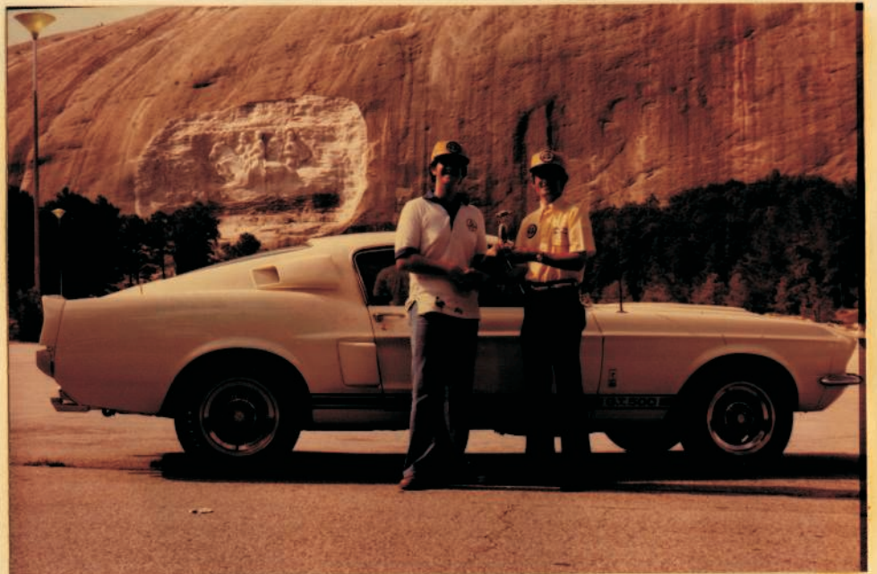
67 SHELBY GT 500